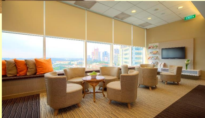
Main Breakfast and Waiting Area