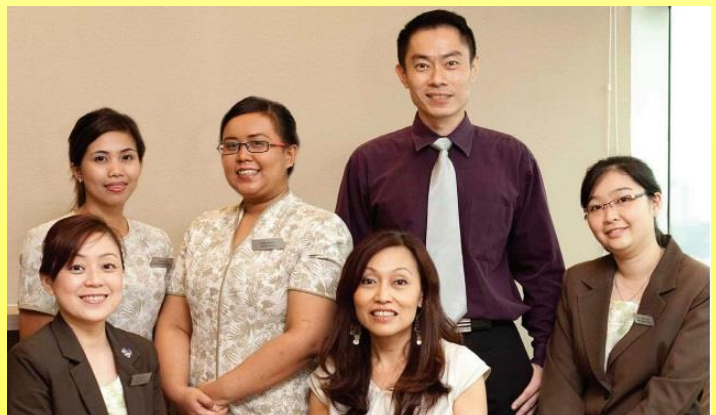
Our Clinical Team