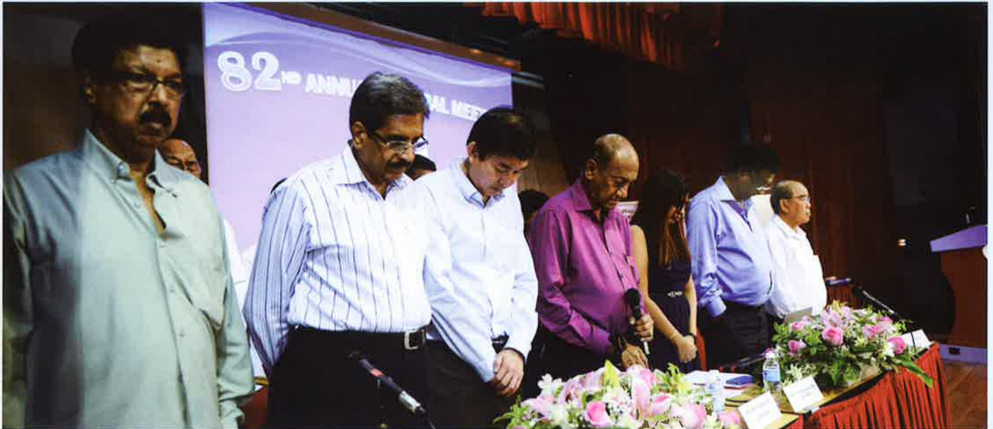
Observing a minute of silence in memory of Singapore's Founding Father, Mr Lee Kuan Yew.