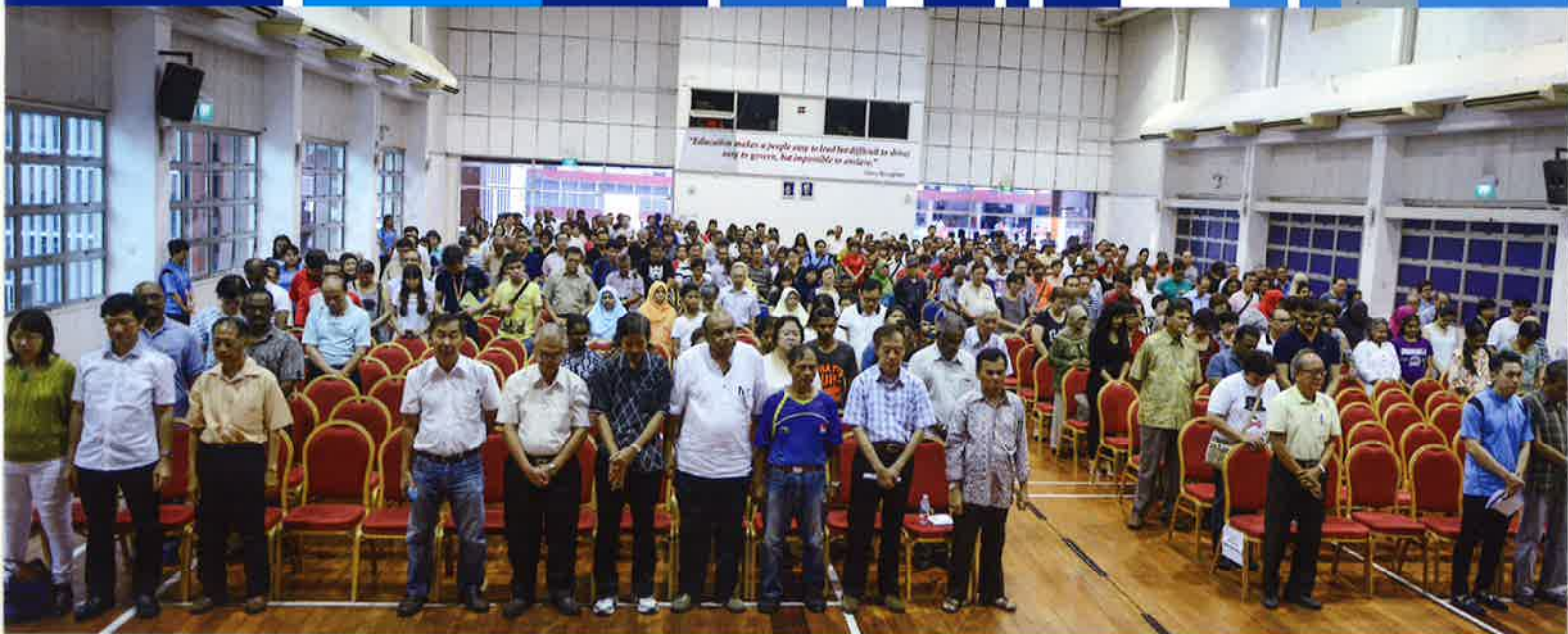
TCC Members observing a minute of silence in memory of Singapore's Founding Father, Mr Lee Kuan Yew

In addition, TCC will be taking part in the Co-op Wheels event on October 9 – 11, 2015. This year's Co-op Wheels is a joint car rally with our fellow co-operatives to Cameron Highlands. It will be an exciting event for TCC members and a great opportunity to meet fellow members of the co-operative movement.