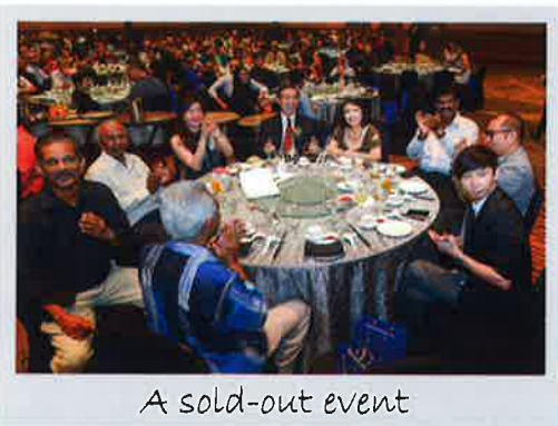
A sold-out event