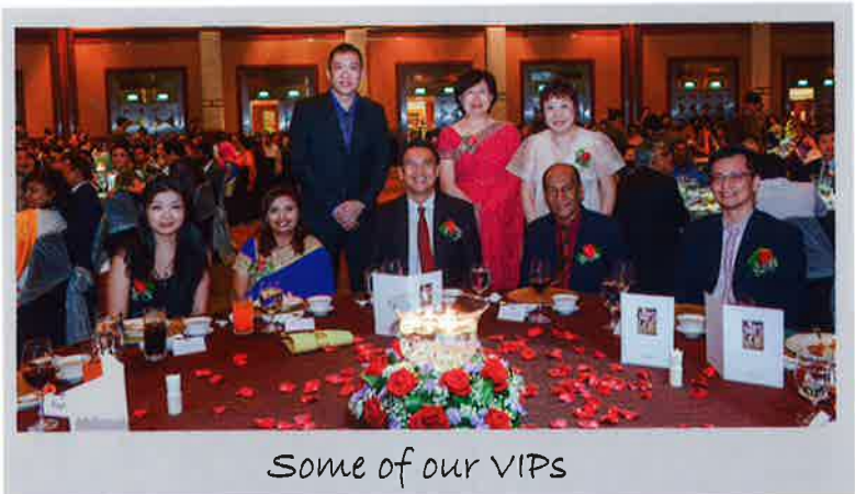
Some of our VIPs