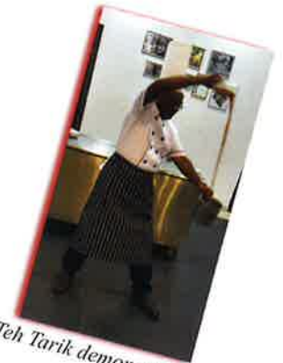
Teh Tarik demonstration