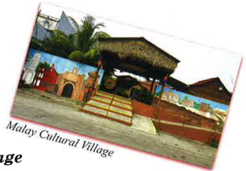
Malay Cultural Village