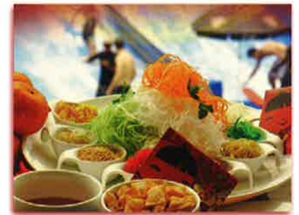
Lo Hei Dinner