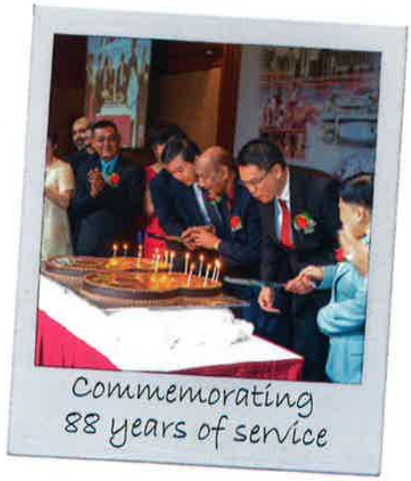
Commemorating 88 years of service

I would like to leave you with this inspirational quote from Gautama Buddha, that embodies what the co-operative movement is trying to accomplish: "Thousands of candles can be lighted from a single candle, and the life of the candle will not be shortened. Happiness never decreases by being shared."